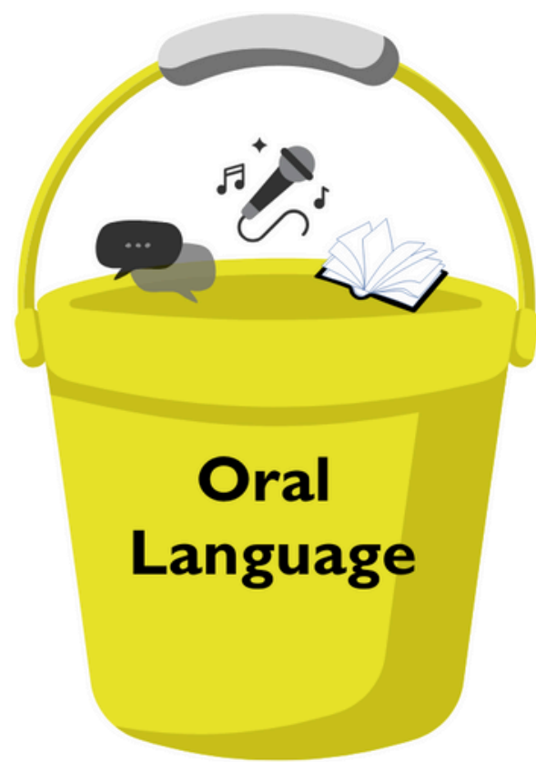
Talk, Read, Sing

Early literacy skills are the foundational abilities that children begin to develop before they start formal reading and writing instruction and are the essential content needed to become proficient readers and writers. These skills are important for future academic success and are instructional priorities in the early years of schooling.